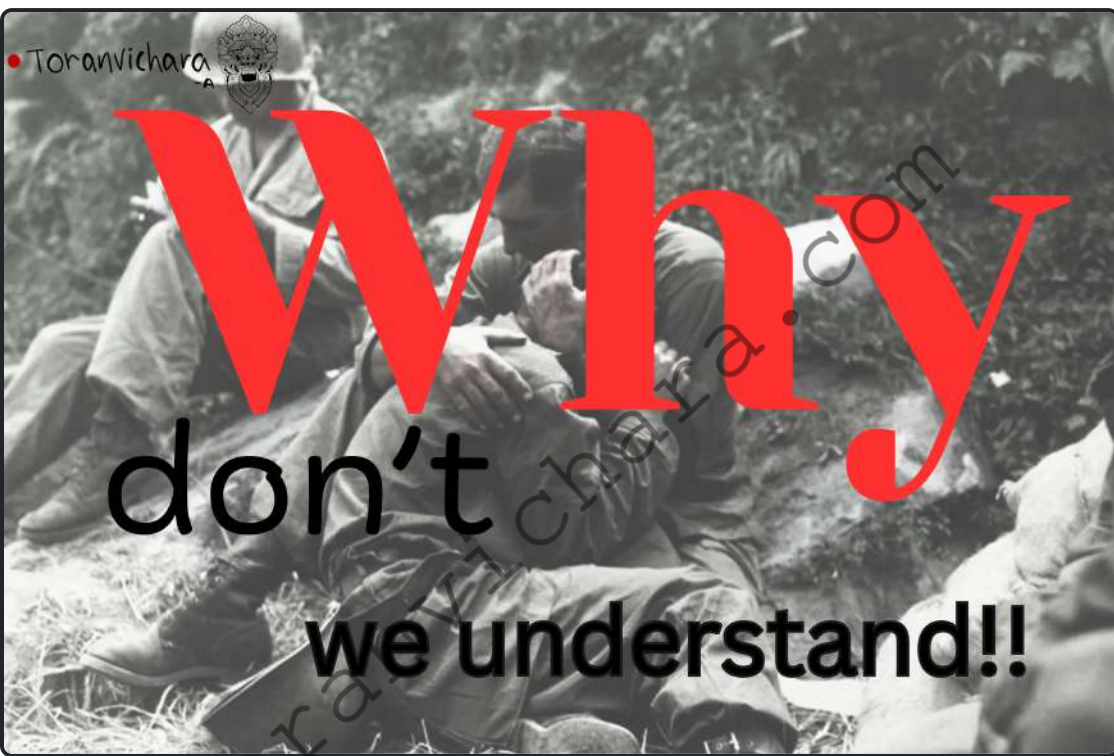
*Why don't we understand!! ~ toranvichara